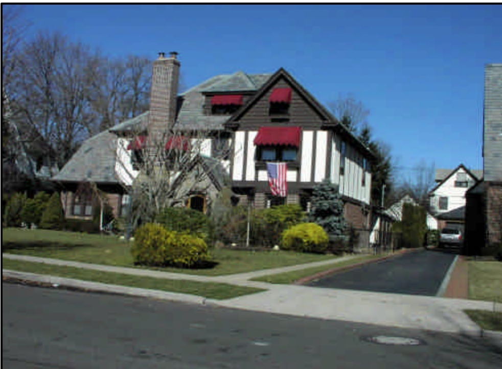
REAR VIEW OF SUBJECT PROPERTY