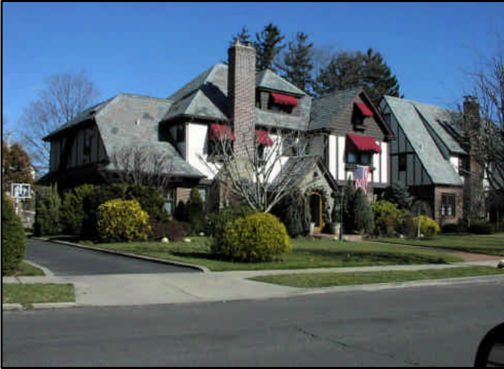
FRONT VIEW OF SUBJECT PROPERTY