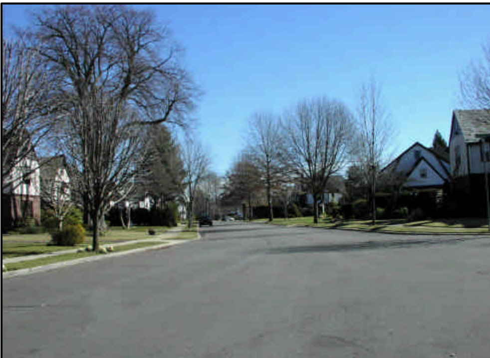
STREET SCENE OF SUBJECT PROPERTY